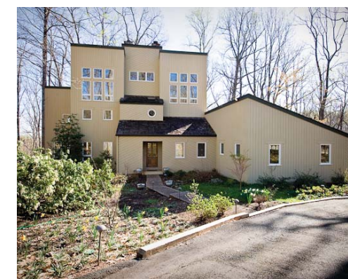
An Exterior View of the Design House.

Susan took 8 years of piano lessons and contemplated minoring in music performance.