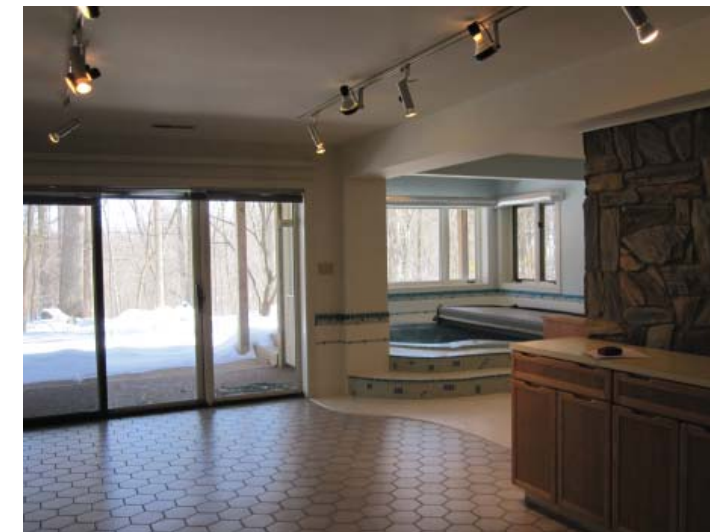
Here's a look at the dark and dated basement room that we're transforming into a high-energy yet relaxing fitness center and spa.

There is a house in Charlottesville that is undergoing a major transformation and Pye Interiors has signed on to refresh the basement. (Anyone who knows about my personal aversion to basements will realize the level of dedication we have for this project!) It's a Design House that benefits the Shelter for Help in Emergency and all of the funds raised will directly help women and children escaping violence in their homes. I'm including a "before" photo so you can appreciate the enormity of our design challenge...YIKES...and I invite you to tour through the house, which is open to the public from May 7th to May 16th, to experience the dramatic makeover first hand. Thanks to the numerous product and labor donations from many generous companies, we now understand the power generated by joining forces to help others.